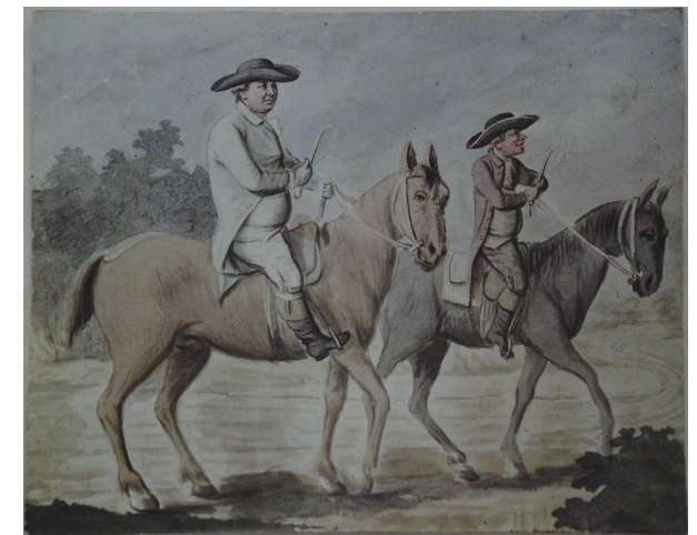
Two men riding

Heritage Lottery Fund contributed £88,000 in the light of local contributions from Sedgemoor District Council, the Friends of Blake Museum and other local organisations and individuals, which amounted to about £9,700. Other national organisations that contributed were the MLA/V&A Purchase Grant Fund (£15,000), and the National Art Collections Fund (£10,00).